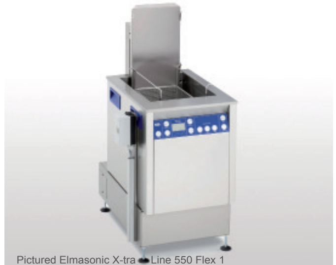
Pictured Elmasonic X-tra Line 550 Flex 1

Modular ultrasonic cleaning unit with oscillation device