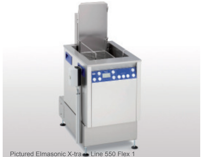
Pictured Elmasonic X-tra Line 550 Flex 1

Modular ultrasonic cleaning unit with oscillation device