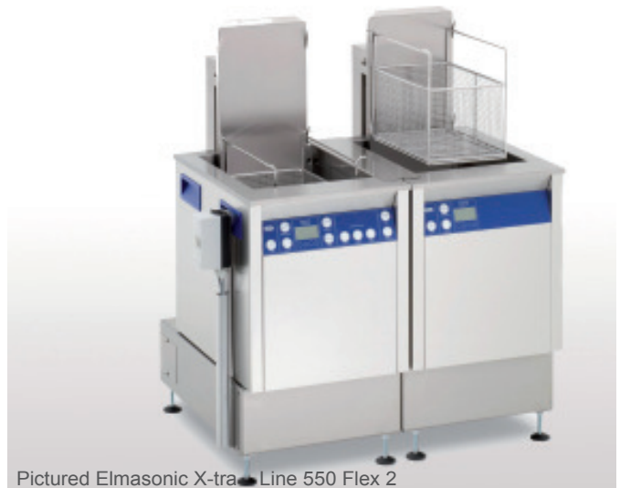
Pictured Elmasonic X-tra Line 550 Flex 2

Modular cleaning line consisting of ultrasonic cleaning unit plus rinsing unit, available in 5 different unit sizes (300, 550, 800, 1200 and 1600). There are two different models for each size: multi-frequency 25/45 kHz (MF2) or 35/130 kHz (MF3). Available rinsing tank models (S): with heating (H) or without heating. The oscillation device for the cleaning basket assists and improves the cleaning and rinsing effect and also provides a drip-off support for the stainless-steel basket (EKO). The cleaning line can be fitted with a hot air dryer (WLT) of the relevant size. The units are delivered including support frame.