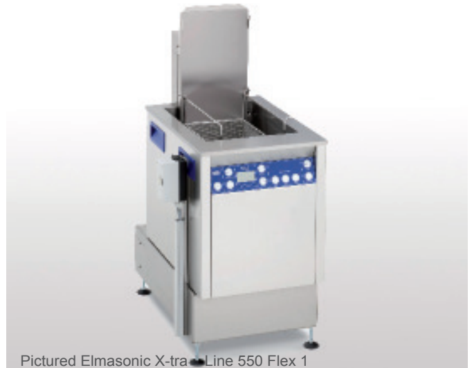
Pictured Elmasonic X-tra Line 550 Flex 1

Modular ultrasonic cleaning unit with oscillation device