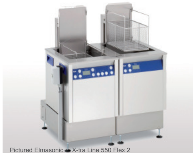
Pictured Elmasonic X-tra Line 550 Flex 2

Modular cleaning line consisting of ultrasonic cleaning unit plus rinsing unit, available in 5 different unit sizes (300, 550, 800, 1200 and 1600). There are two different models for each size: multi-frequency 25/45 kHz (MF2) or 35/130 kHz (MF3). Available rinsing tank models (S): with heating (H) or without heating. The oscillation device for the cleaning basket assists and improves the cleaning and rinsing effect and also provides a drip-off support for the stainless-steel basket (EKO). The cleaning line can be fitted with a hot air dryer (WLT) of the relevant size. The units are delivered including support frame.