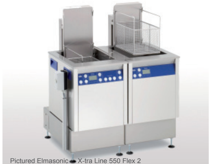
Pictured Elmasonic X-tra Line 550 Flex 2

Modular cleaning line consisting of ultrasonic cleaning unit plus rinsing unit, available in 5 different unit sizes (300, 550, 800, 1200 and 1600). There are two different models for each size: multi-frequency 25/45 kHz (MF2) or 35/130 kHz (MF3). Available rinsing tank models (S): with heating (H) or without heating. The oscillation device for the cleaning basket assists and improves the cleaning and rinsing effect and also provides a drip-off support for the stainless-steel basket (EKO). The cleaning line can be fitted with a hot air dryer (WLT) of the relevant size. The units are delivered including support frame.