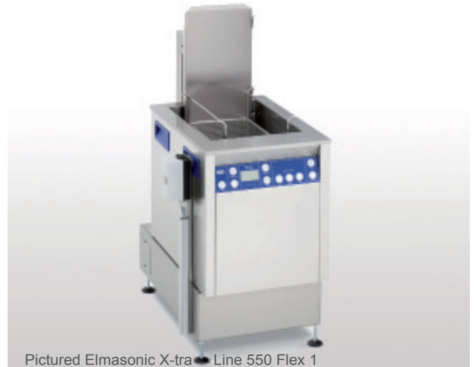
Pictured Elmasonic X-tra Line 550 Flex 1

Modular ultrasonic cleaning unit with oscillation device